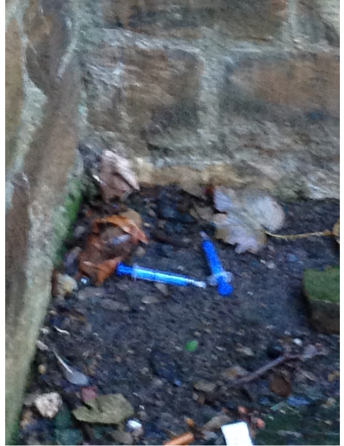
It is evident from the syringes and wrappers left that the Holy Sepulchre churchyard is being used on a wide scale for drug use.